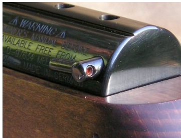
Picture shows RS Safety Catch depressed and rifle ready to fire.