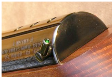
Picture shows RS Safety Catch reset after Mode 1.

The RS Safety Catch functions in the same way as the factory unit, which offers automatic set (or safe) during the cocking sequence. The RS Safety Catch can be depressed to disengage safe mode, as per the original factory unit, which will enable the rifle to be fired. The RS Safety Catch has a red indicator section, as per the factory unit, which is visible on the right-hand side of the action, when the safety is released. An additional red indicator is also visible on the left-hand side, when the Safety Catch is in fire mode.