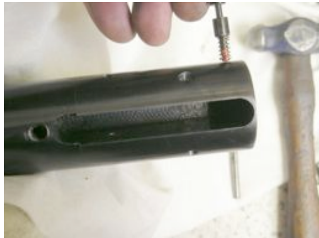
Pic 2: Remove the trigger mechanism and the Safety Catch with spring.