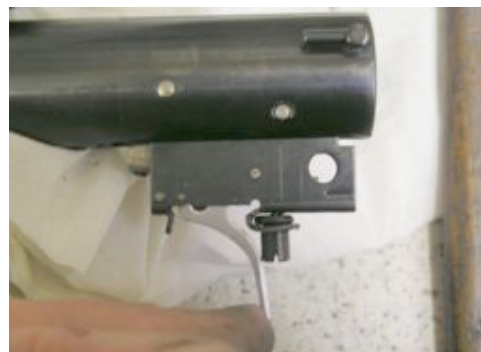
Pic 8: With the pins in place, pull the trigger. The rear sear should completely disengage from the interlocking sear. The sears when engaged can be clearly seen in Pic 7.