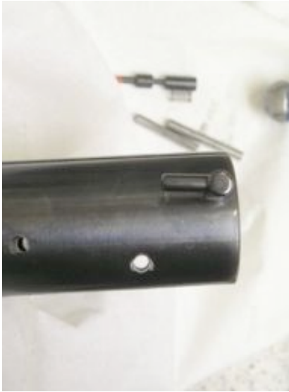
Pic 3: Fit the RS Safety Catch with the spring from the original into the action, in the position shown.