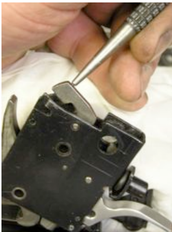
Pic 5: This area, as in Pic 4, can also be lightly stoned and polished. This may assist the smooth re-set of the Safety Catch. Light stoning to the areas highlighted in Pic 4 and 5 will not alter the safety of the mechanism in any way, the intension is to just improve the surface finish, which can vary in production.