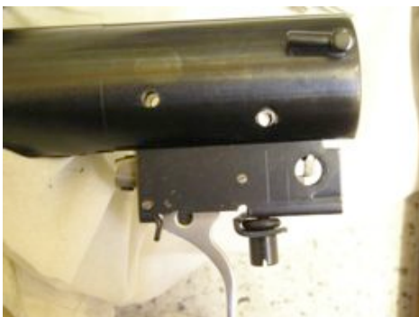
Pic 7: The trigger fitted into the action, Safety Catch in the off position and trigger still cocked.