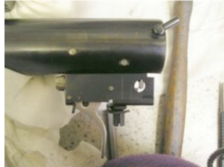
Pic 10: Depress the Safety Catch and cam backwards to ensure that the Safety Catch is re-setting. This is visible showing the sears disengaged as in the picture. Pulling the trigger will confirm that the Safety Catch is still on. Push the Safety Catch forward again, pull the trigger and check that once more the trigger has completely disengaged.

Important: The fitting sequence must be carried out as detailed above to ensure that function is correct before attempting to cock and fire in the usual manner. Failure to do so could possibly render the gun cocked and unable to discharge.