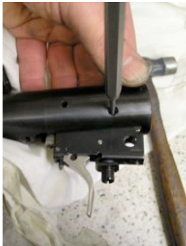
Pic 1: Tap out the 2 retaining pins that hold the trigger mechanism in place. Hold the Safety Catch whilst doing so, to stop it popping out.