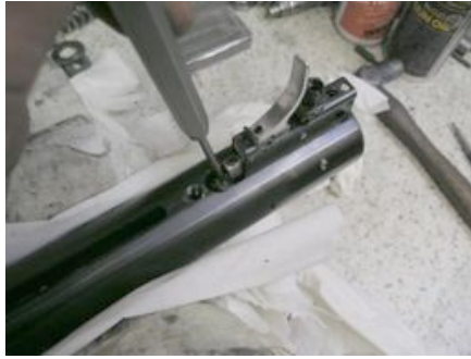
Pic 9: Repeat the manual cocking process, this time by pressing onto the sear from beneath, firmly with a pin punch or similar.